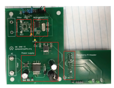
Figure 3: OPQ Board

For our sensor network to scale, a significant amount of processing must be performed on the device itself. This includes power quality event detection, as well as buffering of historic data leading up to the event. Furthermore, event data needs to be uploaded to the cloud for further analysis. Currently, we use a Raspberry Pi single board computer for the main processing unit. The MSP430AFE sends digitized samples to the Raspberry Pi via the SPI protocol. Data is compared to the expected waveform, and if the deviation is significant, an event containing the raw data is send to the cloud via a USB 802.11 adapter. We have designed a custom protocol for data transmission to reduce the bandwidth required [4]. The device and cloud service communicate using server-side events (SSE) over HTTP, which enables the device to be sent commands from the cloud even though it will be located behind a home wireless router.